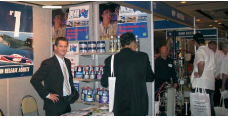
Exhibit your products & services – or give a practical demonstration

Last year's booth spaces sold out and the exhibit was rated a great success. Once again, free passes for the exhibition will be available to local fabricators and other interested parties. Register your interest in reserving a booth and/or demonstration space with the form below. You will be sent advice on a floorplan and booking form with options and costs.